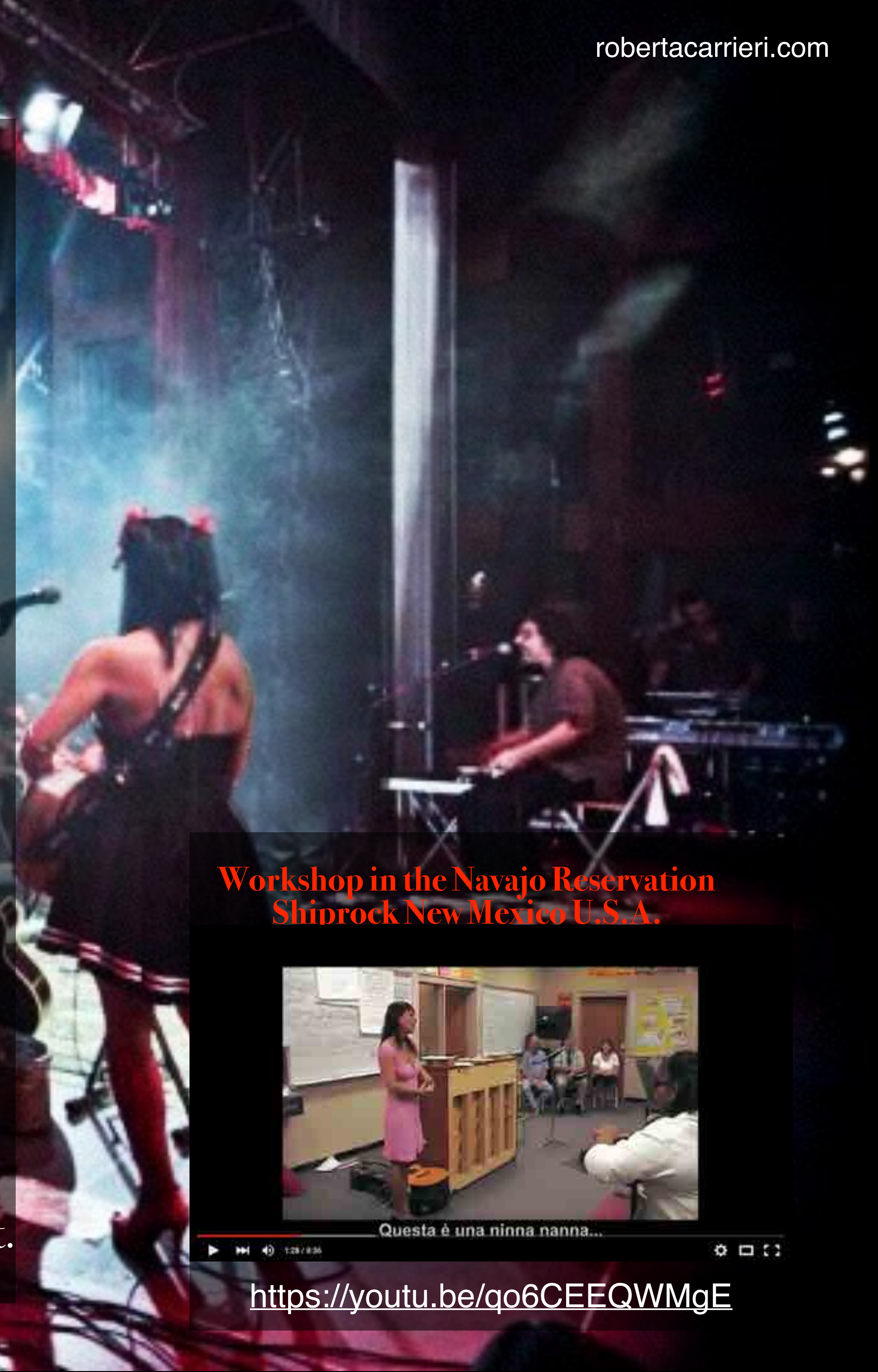
Workshop in the Navajo Reservation Shiprock New Mexico U.S.A.

Wherever possible the idea is to create a musical encounter which encourages the participants to seek out similarities with their own local to disseminate and bring together the various musical traditions by promoting the exchange between them, and passing a few pleasurable hours singing along, with joy of someone who wants to learn more about Italy and experiment its language and its dialects. An audience of musicians is not necessary. The workshop could be hosted in the same venue as the concert.